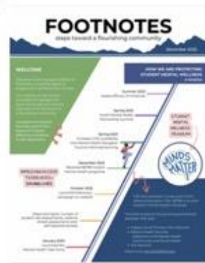
FOOTNOTES DECEMBER 2022

Students' Matters conferences engage learners to review SOS-Q data and form a plan to address areas of opportunity within their own school. This builds a culture of compassion and develops leadership skills