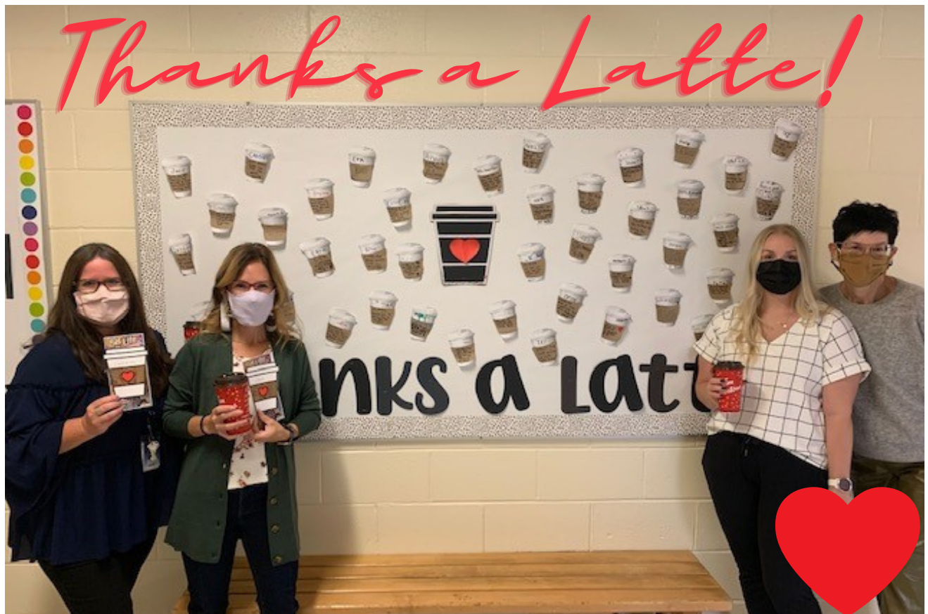
Some of our amazing staff reading messages from the students.

For World Teachers Day, students made "Thanks a Latte" cards for our school staff. Here are some of the things our students wanted to thank them for: