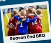
Season End BBQ

Monday - U11 @ 6pm Tuesday - U7 @ 6pm Wednesday - U5 & U13 @ 6pm Thursday - U9 @ 6pm