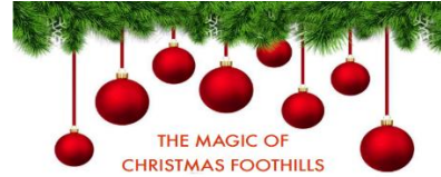
THE MAGIC OF CHRISTMAS FOOTHILLS