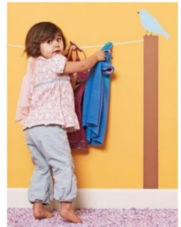
Routines and self help skills