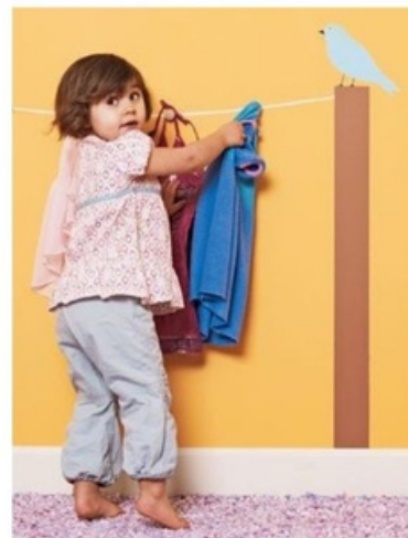
Routines and self help skills