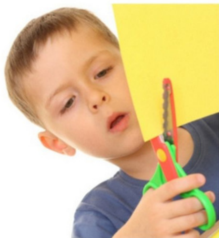
Scissor and pencil skills