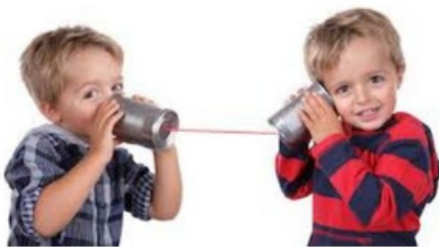
Communication and social skills