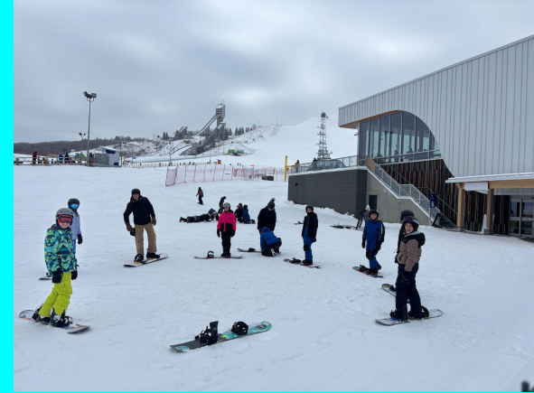
Regional Band Festival in Edmonton, Secret Agents, Skiing