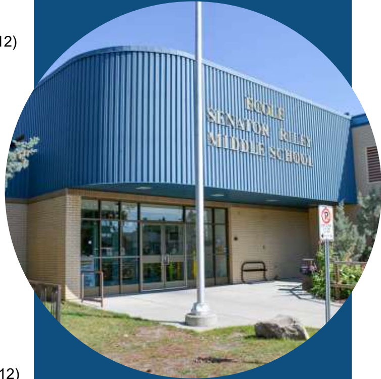
École Senator Riley Middle School High River