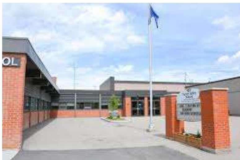
Turner Valley School Diamond Valley