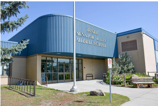
ÉCOLE SENATOR RILEY MIDDLE SCHOOL, High River