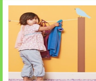
Routines and self help skills