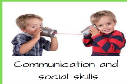
Communication and social skills