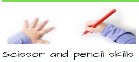
Scissor and pencil skills