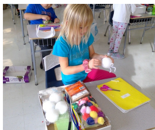
Grade 2 Science