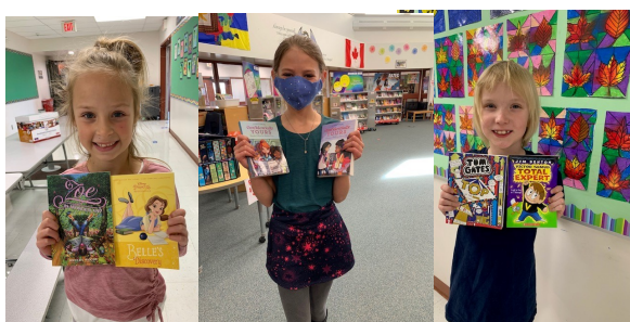
BOOK FAIR WINNERS