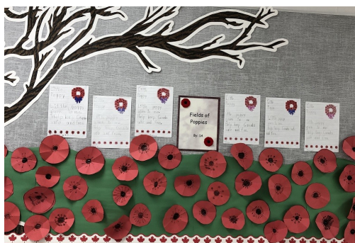
Grade 1 Poppies

For more information, please feel free to contact your child’s teacher or school administration.