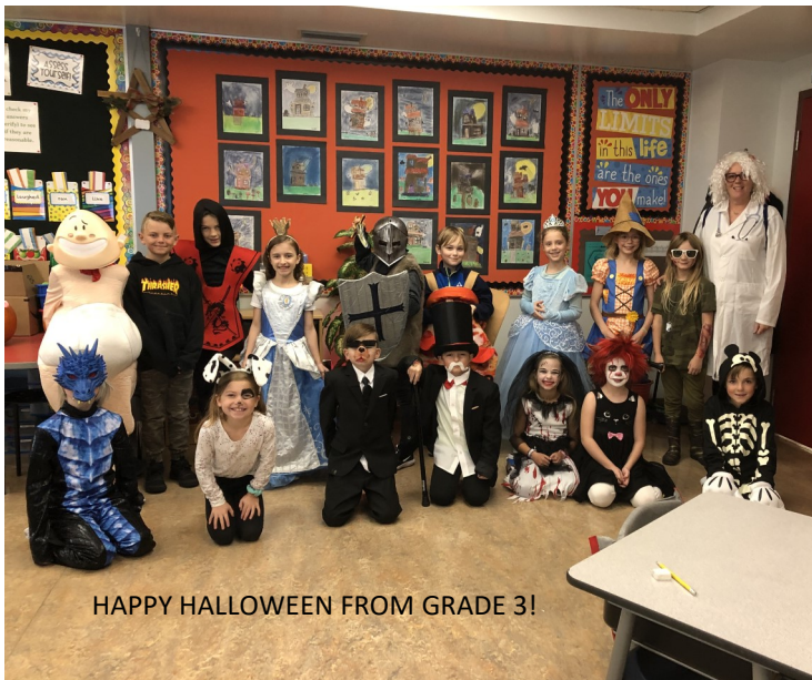
HAPPY HALLOWEEN FROM GRADE 3!